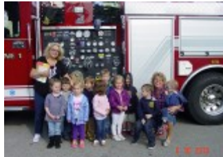
The Preschool Class