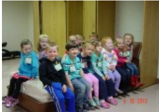
There is more than 10 Pre-K monkeys sitting on the firefighter's Murphy bed! (They all would love a bed like this!)

Time flies when you are having fun! With that said, the month of October has just flown by at Shepherd of My Heart Christian Preschool! We celebrated Fire Prevention Week in October and used the entire month to reinforce fire safety! We explained to the children how important it is to learn and practice fire safety so they know just what to do if there is a real emergency! The Pre-K class visited the city fire station and the younger class actually got a visit, right here at NSCC, from 2 firefighters and a ladder truck! Both classes completed fire drills, stop-drop-roll, and practiced the emergency number 9-1-1. Of course there are songs that go along with what they are learning making important concepts much easier to remember! During the busy month of October, the children also had their school pictures taken and we ended the month with a fun and educational field trip to Iron Mill Farmstead!